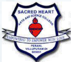
SACRED HEART ARTS AND SCIENCE COLLEGE, PERANI