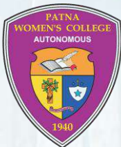
PATNA WOMEN'S COLLEGE (AUTONOMOUS), PATNA UNIVERSITY