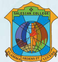
SALESIAN COLLEGE, SONADA & SILIGURI