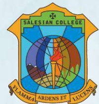
SALESIAN COLLEGE, SONADA & SILIGURI